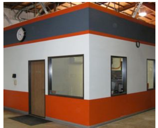
A new restroom and manager's office facility was constructed in the warehouse.