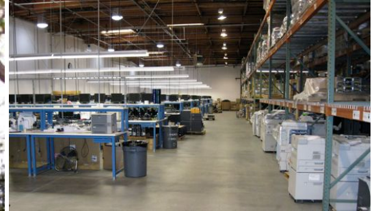
Special drop lighting and air & power lines for one of two computer audit areas.

This 44,000 square foot building received epoxy injections at the tilt-up walls and repairs to the concrete warehouse floors. Four new windows were sawcut and reinforced into the north and west sides of the 7,000 square foot office area. As a finishing touch, the exterior paint was made to match the corporate color scheme and new concrete entry ramp/stair was added to dress up the exterior and meet current HC/ADA accessibility requirements.