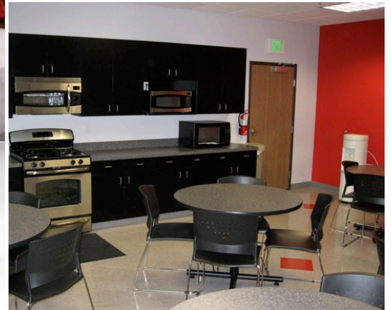
Stainless steel appliances were installed in the custom break room.